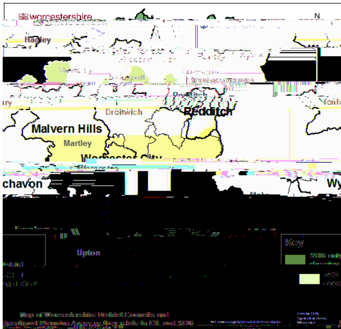
Figure 1: Developer Contribution Arrangements