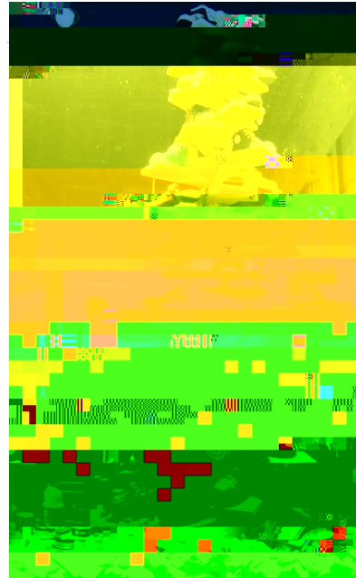
Create a focal point