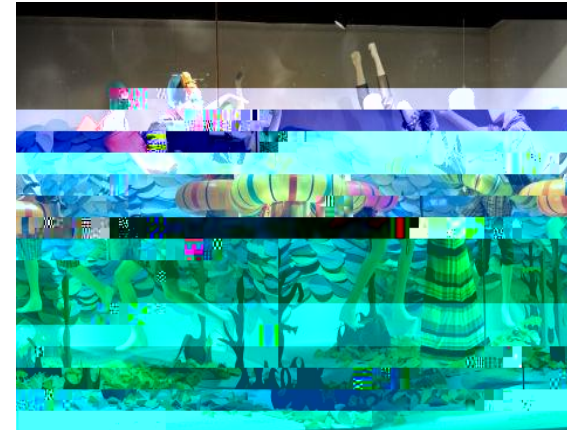
Tell a story