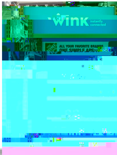
Use empty space well