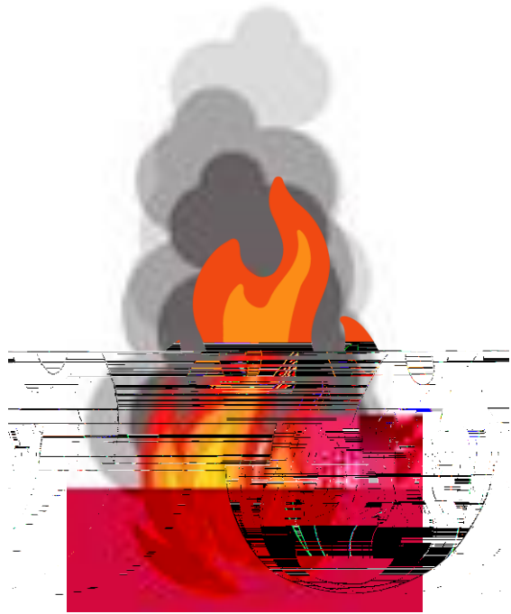
Fire and/or smoke